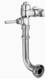
Variations Not Shown: Angle Stop Extended and Less Vacuum Breaker